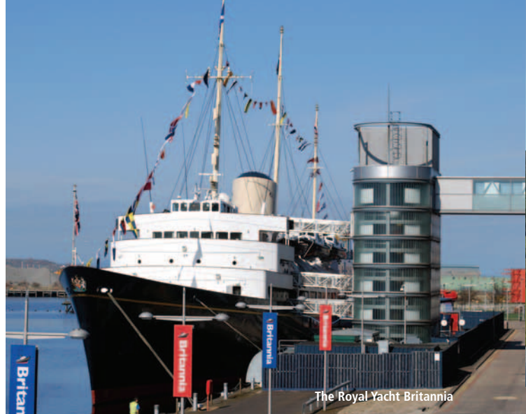
The Royal Yacht Britannia