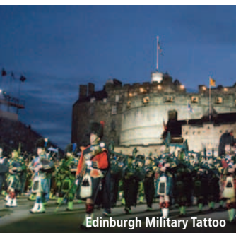
Edinburgh Military Tattoo

Day 4 We depart our hotel for the return journey to South Wales.