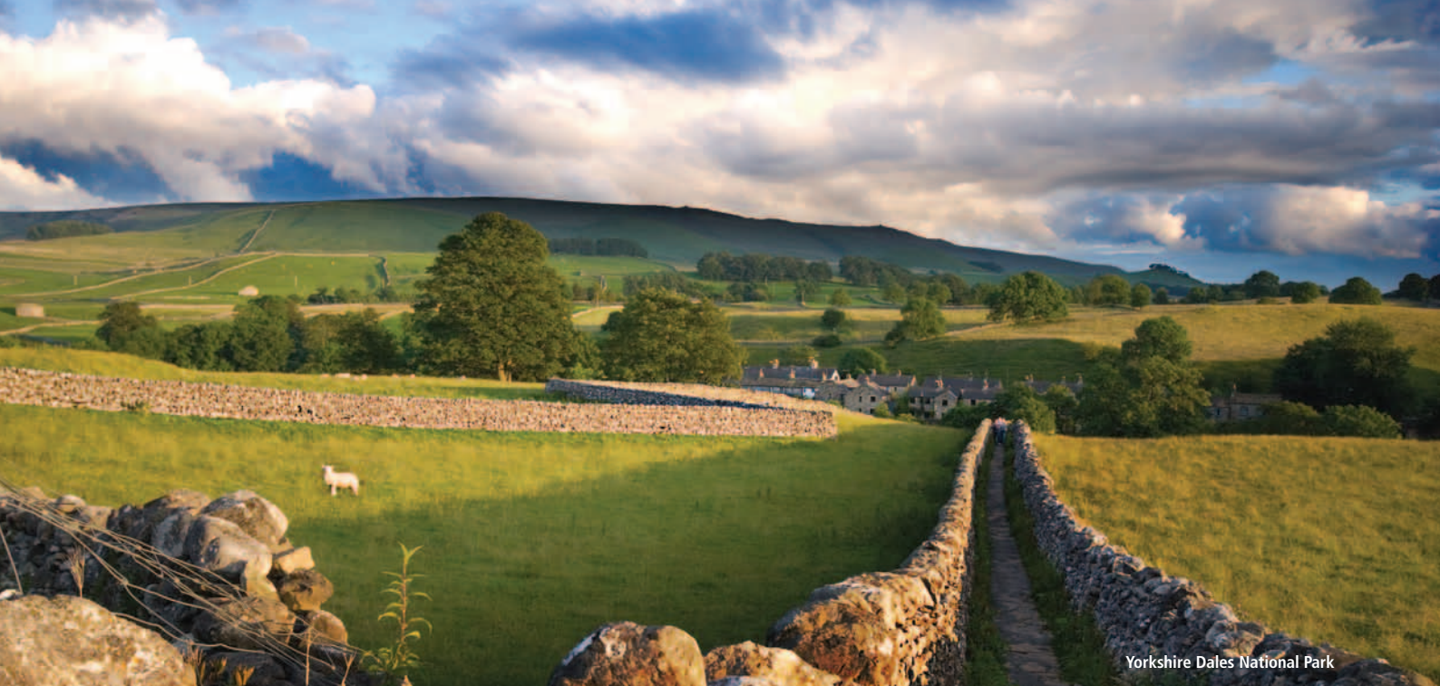
Yorkshire Dales National Park