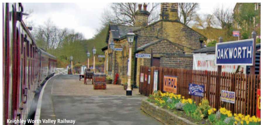
Keighley Worth Valley Railway