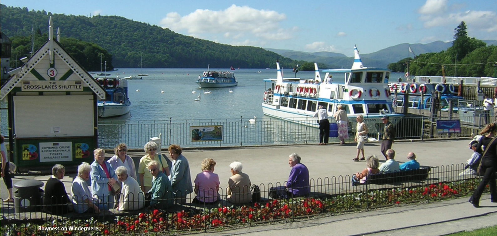
Bowness on Windermere