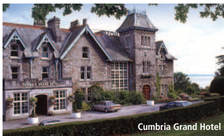
Cumbria Grand Hotel

Day 5 Sadly we depart our hotel for the return journey home.