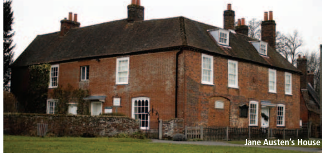
Jane Austen's House